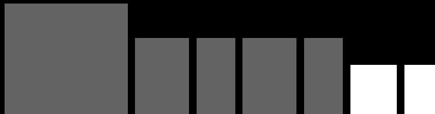
SM FORMULA RACER